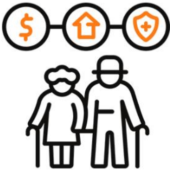
Retirement Income Solutions