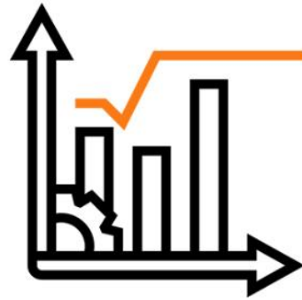
Investment Trends in DC